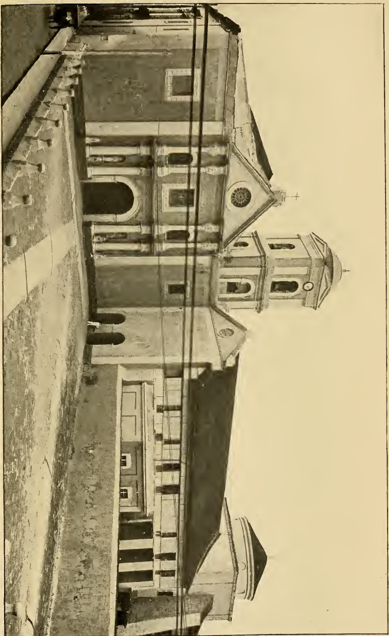
Exterior of Augustinian church and convent, Manila [From plate in possession of Colegio de Agustinos Filipinos, Valladolid ]